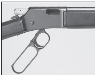
The finger lever in the fully down position.

A “safety” interlock prevents the rifle from firing until the lever and breech bolt are fully closed. Another built-in “safety” feature prevents the rifle from firing even if the trigger is depressed while the lever is closing. Should this occur, release finger pressure from the trigger and the rifle will be ready to fire with the next squeeze of the trigger.