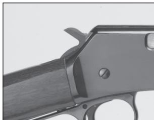
The hammer shown in the dropped or fired position.