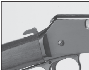
The hammer shown in the full-cock position.