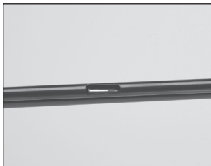
The magazine is full when a cartridge is visible in the loading port.